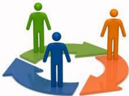
Extra Team Members