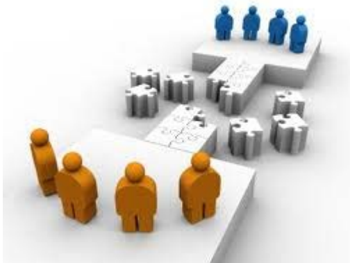
Two Support Teams