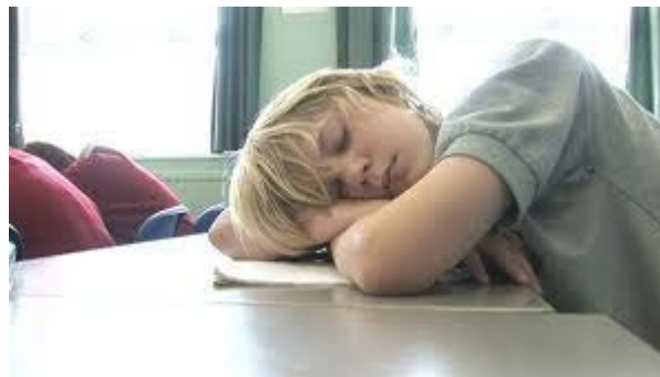
Project Fatigue ***