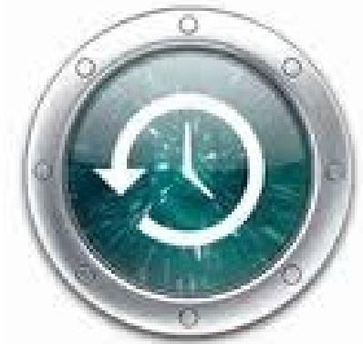
Test your Backups