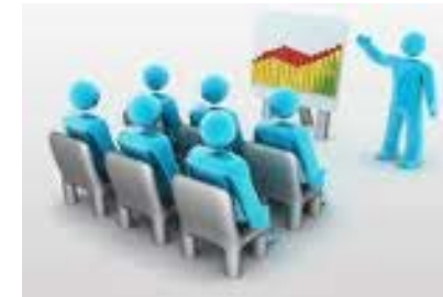
Train your staff